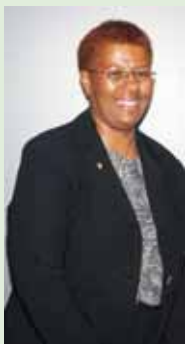
Conference Lay Leader Message PAGE 5

A Pathway to Healthy Disciples involved in Healthy Ministry Leading to Healthy Churches