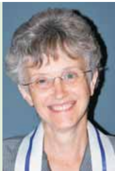
Bishop's Letter of Hope PAGE 8

A Pathway to Healthy Disciples involved in Healthy Ministry Leading to Healthy Churches