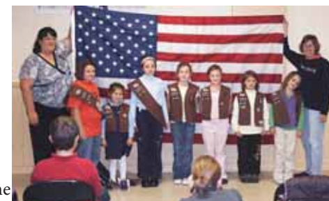
Brownie Troop 678

With this kind of energy and excitement, we know that