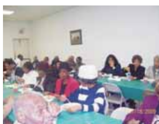
Participants and guests gather after the celebration service for fellowship and refreshments