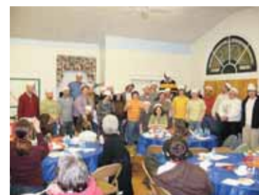
All the cooks