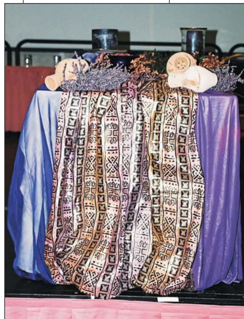
Altar during Bishop's Retreat