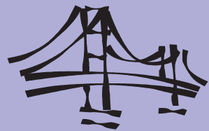
"The Bridge 2007" Page 8