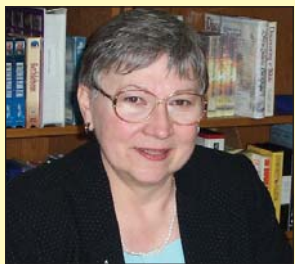
Interfaith Resource Center Page 5

that there are 'people everyone – and most are not in our churches.' He said that we should be "so caught up in God's vision that (we) are not bound by (our) present moment (but that we) look beyond the walls – to not be satisfied but to continue to reach out and reach through using both arms" to our communities. Bishop King also emphasized the need to both 1) use one arm to love the people you are with and 2) use the other arm to reach out beyond our status quo.