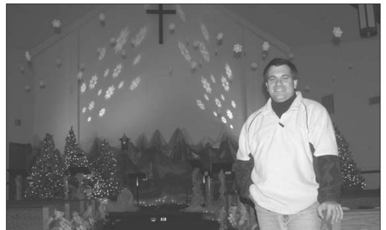
experienced many begin this relationship or grow deeper with Christ through the magical world of Narnia and the "Lord of the Wood," Aslan.