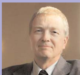
From Your Wesley College Chaplin Page 4

The Peninsula-Delaware Conference, as the body of Christ, will live out the ministry and teaching of Jesus Christ – boldly, cooperatively, and inclusively – through life-changing communities of compassion.