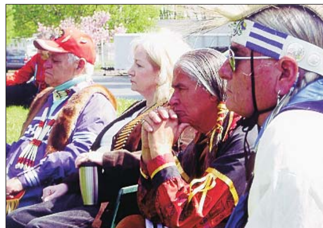
Participants at the Native American Ministry Sunday in Smyrna

CONAM would like to thank everyone who opened up their hearts and contributed their gifts to make this event meaningful and special.