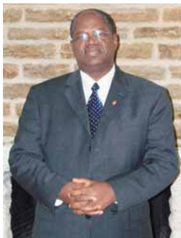
Bishop David Yemba

Together, they cover 10 out of 11 provinces in the Democratic Republic of Congo. Yemba said it is a challenge to serve such a large area. "The Congo has just gotten out of repeated wars and we need